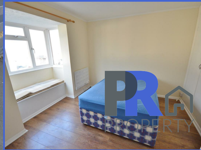
25 Twigden Court, Mount Pleasant Road, Luton, Bedfordshire, LU3